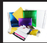
Poly Bags, Mailers & PLE's